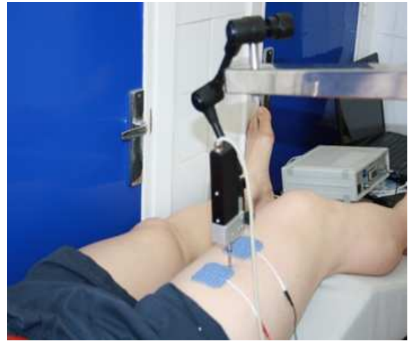
Fig. 2: TMG assessment in RF of right leg

Maximal graded exercise test: After a standardized warm-up consisting of 5 min of pedaling on a cycle ergometer (Kettler Axiom P2, GmbH and Co.KG, Ense-Parsit, Germany) at a load of 50 W, participants performed a maximal graded exercise test. The initial load was 50 W and increased by 25 W every min until exhaustion with a pedaling frequency of 60 rpm. Gas analyses were performed using a breath-by-breath gas analyzer (VO2000 Portable Metabolic System, Medgraphics, St. Paul, MN), whose validity was previously proved by Byard and Dengel (2002). Before each test VO2000 was manually calibrated according to manufacturer guidelines. \text{VO}_{2\text{max}} corresponded to the highest \text{VO}_2 attained in two successive 15 s periods for the maximal graded test. In addition, HR was continuously monitored (Polar 800 CX, Polar Electro, Kempele, Finland). It was considered that participants had reached their \text{VO}_{2\text{max}} when three or more of the following criteria were met: (a) a steady state of \text{VO}_2 despite increasing load (changes in \text{VO}_2 at \text{VO}_{2\text{max}} \leq 150 mL); (b) a final respiratory exchange ratio higher than 1:1; (c) visible exhaustion; (d) an HR at the end of the exercise ( \text{HR}_{\text{max}} ) within the 10 bpm of the predicted maximum ( 220 - \text{age} ). Also, \text{pVO}_{2\text{max}} was defined as power output (W) developed by the participants on the cycle ergometer when \text{VO}_{2\text{max}} was reached.