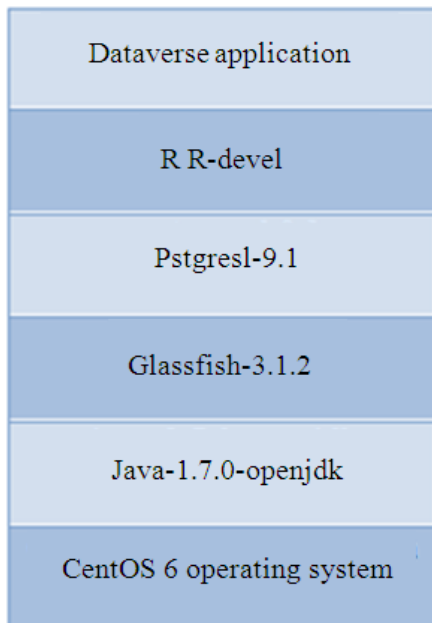
Fig. 3. Dataverse network tiers

The DVN is a multilayer application. There are four applications that must be installed before installing the dataverse application itself and these are: Java 1.7.0 open JDK, glassfish server 3.1.2 open Source Edition, Postgre SQL 9.1 and R R-Devel. The order of the layers, or tiers, has to be correct in order for the project to work. Figure 3 shows the tiers of our DVN. The top tier is the dataverse application. Java1.7.0 Open JDK is installed to support the run time of the Java environment programs. Glass Fish is an application server that helps to carry the DVN application. Postgre SQL is installed to manage databases created for research and R R-Devel handles statistics and graphs.