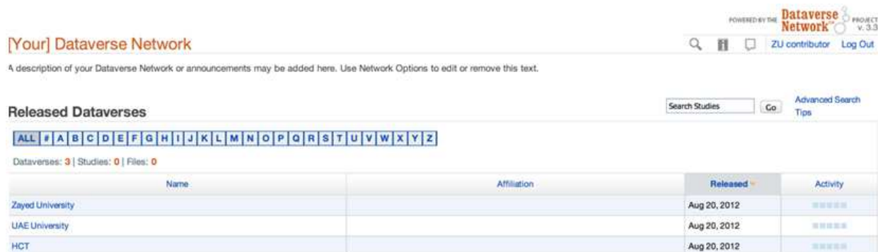
Fig. 1. The simple interface of our DVN design

Ankabut is very keen and ambitious in terms of providing nonproprietary software to the research and educational sectors in the UAE over its dedicated network. It must consider cross-platform issues, the high cost of licensing products and the adoption of OSS standards as a framework to deliver high quality services. Ankabut has shown a great deal of interest in collaborating with us on the proposed DVN project. They have shown their willingness to contribute, in terms of operational management, connectivity, deployment and data management, as well as providing a central data repository.