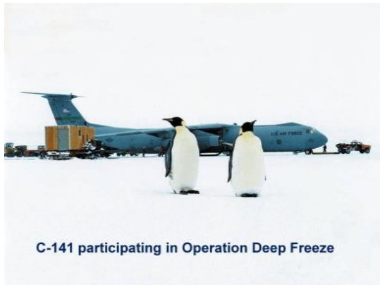
Fig. 16. C-141 who participate in the operation of the deep freezing