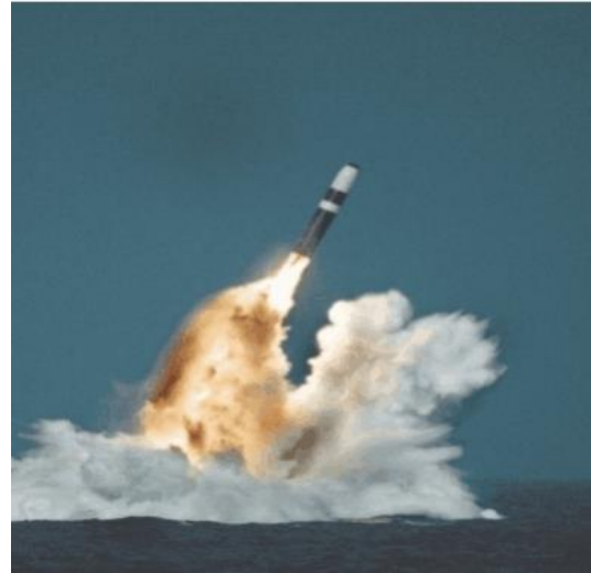
Fig. 11. Submarine launch of a Lockheed trident missile

The first F-35 flew to December 15, 2006. USA intends to buy 2.457 of aircraft. The variants are to provide the greater part of the air forces the tactical fitted with air forces the U.S. Navy and Marine Corps in the coming decades. Deliveries F-35 for the American army is scheduled up to the 2037 gymnasium, with a long life designed by 2070.