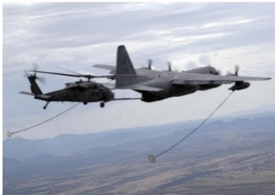
Fig. 7. USAF HC-130P refuels a HH-60G Pavehawk helicopter

RC-130 is a version of the recognition. A single example is used by the air forces of the Islamic Republic of Iran, plane being initially sold the former air forces of the imperial Iranian.