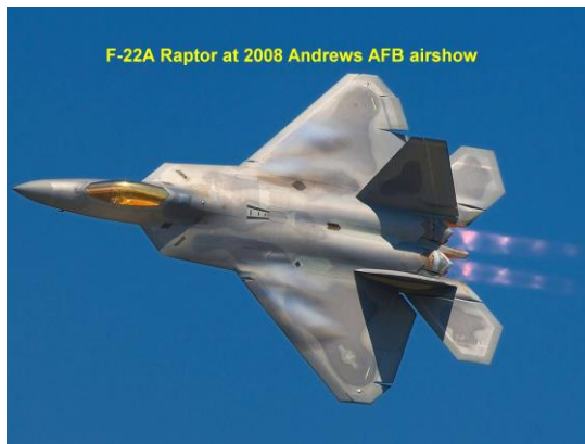
Fig. 25. Lockheed Martin/Boeing f-22 raptor is a fight super-manueverable