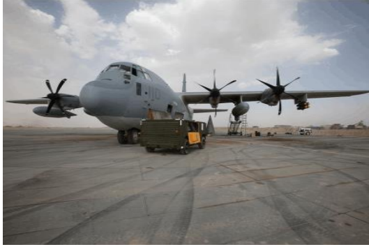
Fig. 10. A KC-130J showing the AN/AAQ-30 Targeting Sight and AGM-114 Hellfires on the left wing in Afghanistan, 2011

LM MFC has approximately 10,600 employees, most of them being divided between Orlando, Florida and Grand Prairie, Texas. Other major facilities LM MFC are located in Archbald, Pennsylvania; Chelmsford Crown, Massachusetts; East Camden, Arkansas; Horizon City, Texas; Lufkin, Texas; Ocala, Florida; Santa Barbara, California; Troy, Alabama and Ampthill Bedfordshire (a portion of the Lockheed Martin UK), (Fig. 11).