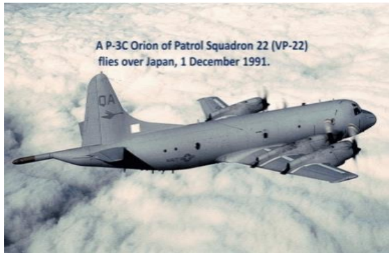
Fig. 26. Lockheed P-3 Orion is an aircraft with four motors turbo prop anti-submarine and maritime surveillance developed for the Merchant Navy of the United States