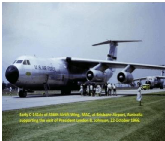
Fig. 14. Early Lockheed C-141 airlift wing