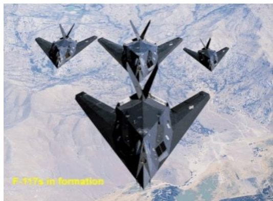
Fig. 23. Lockheed F-117s in formation