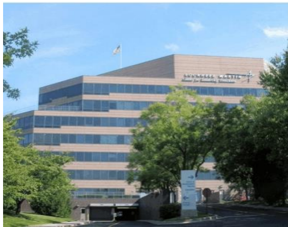
Fig. 1. Lockheed Martin's Center for Leadership Excellence (CLE) Building in Bethesda, Maryland