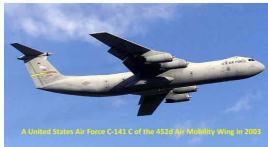
Fig. 13. Lockheed C-141 starlifter