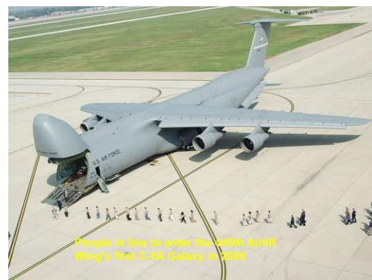
Fig. 20. People enter on a model Lockheed C-5 Galaxy, in 2005

The Air Force withdrew F-117 on 22 April 2008, in the first place due to the launching of the field F-22 Raptor and placing the imminent of F-35 Lightning II.