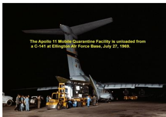
Fig. 15. Lockheed C-141 Airlift Wing for Apollo 11

The prototype and aircraft of development have started then a program intensive operational test, with the first delivery to the mats (63-8078), on 19 October 1964, 1707a Air Wing Heavy (Training), Tinker Air Force Base, Oklahoma.