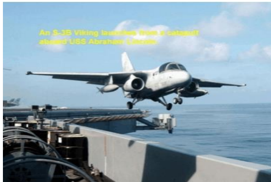
Fig. 27. Lockheed S-3 Viking is a plane with four places, which has been used by the US titles in order to identify and pursue the enemy submarines