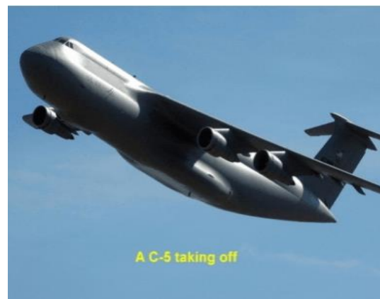
Fig. 19. A model Lockheed C-5 Galaxy taking off