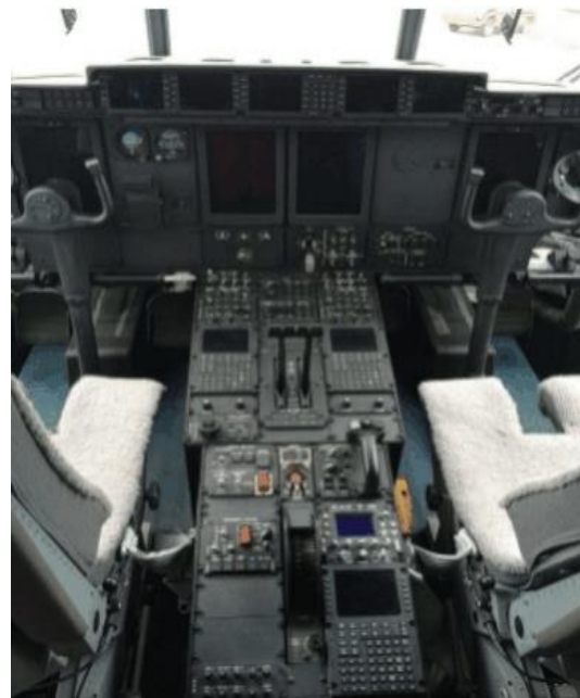
Fig. 9. Super Hercules cockpit

With the addition of kit of missions ISR/Weapon Mission Marine Corps, variant the tank KC-130J will be able to serve as an aircraft of survival and can provide fire the palm to the ground in the form of Hellfire missiles or Griffin, bombs with precise guidance and possibly 30mm cannon of fire in an upgrade later. This capability, designated as "Harvest HAWK" (Hercules Airborne Weapons Kit), can be used in scenarios in which the accuracy is not a requirement, such as the