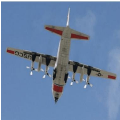
Fig. 5. United States coast guard HC-130H

This aircraft has been strongly modified (with the most prominent feature being atmospheric probe long and long red on the nose and the movement of the