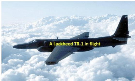
Fig. 28. Lockheed U-2, called "Dragon Lady" is an aircraft for the recognition, high altitude, operated by the United States Air Force (USAF)

This concept of supersonic cruise is among the projects submitted in April 2010 to the direction of the Aeronautics Research NASA to NASA studies research funded in the field of advanced aircraft that could come into service in the 2030-2035 period (Fig. 29).