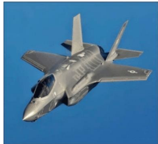
Fig. 12. F-35A Lightning II

The United States financed mainly to the development of the F-35 JSF, with additional financing from partners. Partner countries are either NATO member states, be close allies of the USA.