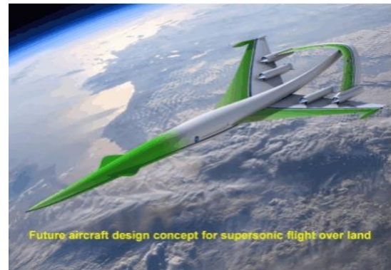
Fig. 29. Lockheed martin supersonic design concept

This concept of supersonic cruise is among the projects submitted in April 2010 to the direction of the Aeronautics Research NASA to NASA studies research funded in the field of advanced aircraft that could come into service in the 2030-2035 period (Fig. 29).