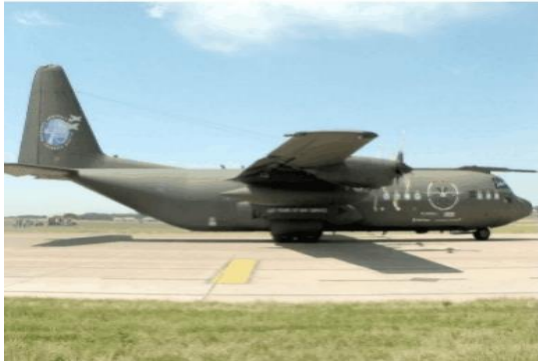
Fig. 6. Royal air force C-130K (C.3)