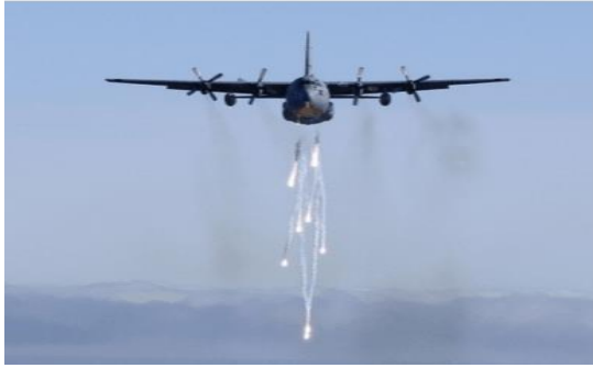
Fig. 3. A michigan air national guard C-130E dispatches its flares during a low-level training mission