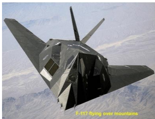
Fig. 22. Lockheed F-117 Nighthawk is an aircraft of attack against the ground with a place, with dual motors