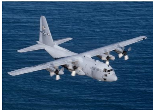
Fig. 2. Straight-wing, four-engine turboprop-driven aircraft overflying water

A key feature was the introduction of the turbo prop engine Allison T56, developed for C-130. At that time, turboprop was a new application of the engines with the turbine which uses the exhaust gases in order to transform the propeller which offer a range of more than at speeds led by the blade in comparison with pure turbo shafts, which have been the faster but have consumed more fuel. As in the case of the helicopters in that time, such as UH-1 Huey shaft, thirty has produced much more power for their weight than engines with piston. Lockheed will subsequently be used the same engines and technologies to Lockheed L-188 Electra. The aircraft has failed financial year in Configuration to civil society, but has been adapted successfully to the plane patrol Lockheed P-3 Orion and the plane of attack submarine, where excels efficiency and resistance turboprops.