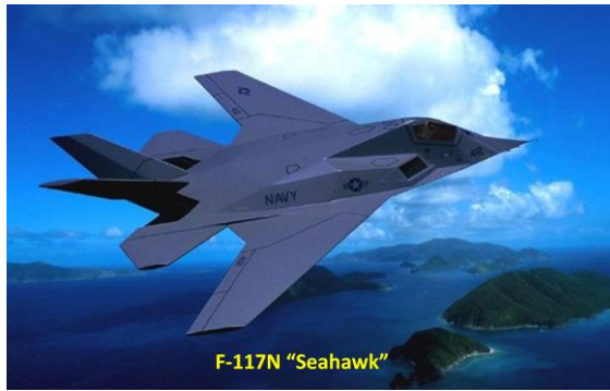
Fig. 24. F-117N "Seahawk"