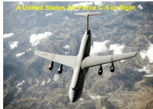
Fig. 18. A model Lockheed C-5 Galaxy

It has been called in the usual way "Stealth fighter", though it was a plane of attack on the ground.