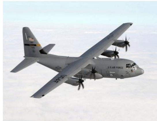
Fig. 8. A U.S. Air Force Lockheed Martin C-130J Hercules aircraft

In mid-June 2008, the United States Air Force have been awarded a contract of 470 million dollars in the company Lockheed Martin for six aircraft KC-130J altered to be used by the forces of the air and the command of special operations. The contract has led to the variants C-130J which will replace the aging of the HC-130 and MC-130. The combination of the HC-130J Combat King II has carried out the tests of development on 14 March 2011. The end point of the test facility has been replenish the air-air and was the first refuelling boom with a C-130, in which the receiver fuel supply has been installed the production of aircraft. This test procedure has been applied and for the plane MC-130J Combat Shadow II in production for the command of special operations for the forces of the airline (Fig. 9).