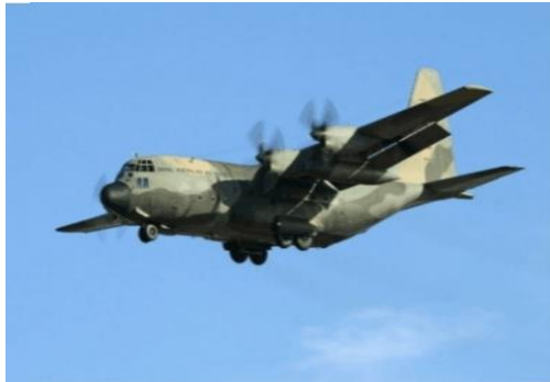
Fig. 4. Royal Australian Air Force C-130H, 2007