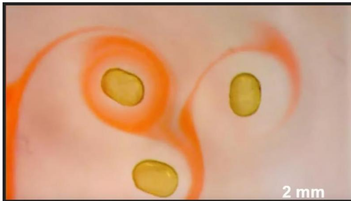
Fig. 1: The first permanently magnetized liquid recently discovered (Berkeley Lab, 18 July 2019)

Russell and his team obtained this liquid magnet by chance while experimenting with a 3D printer. They have tried to print liquids to get new solids but have fluid properties for different energy applications.