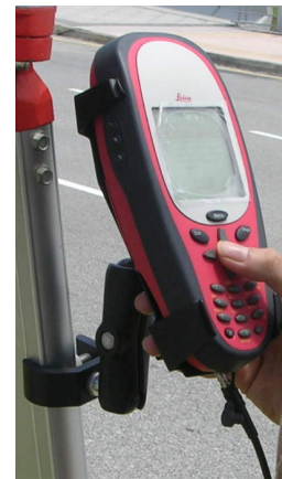
Fig. 2: Leica GS20

This device has an accuracy of about 1 m but when we process it by Leica GeoOffice software, the accuracy reaches 1 cm which would be fairly enough for us to evaluate the deformation of the bridge. Since we are not monitoring the real time movements of the bridge, this accuracy can tell us if any damaging movements have occurred to the bridge or not.