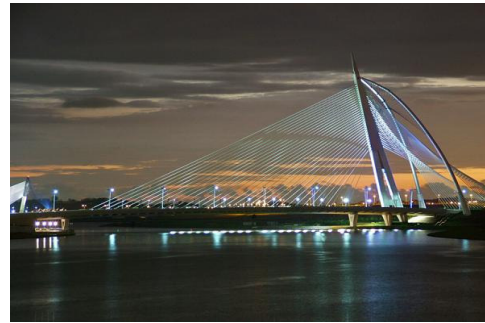
Fig. 1: Persiaran Barat, cable-bridge

Since our project is to evaluate the possibility and the accuracy of using low-cost GPS equipments in order to monitor deformation or the movements of the bridge, we used the Leica GS20 GPS system, which costs about RM 40,000 (Fig. 2). This GPS has LEIAT501 series Leica antenna. The software provided with this GPS is Leica DataPro, but since this software processes single frequency data (L1) we had to switch to Leica GeoOffice software.