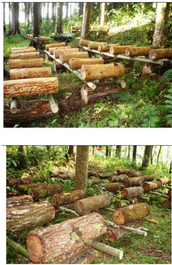
Fig. 1: Experiment installment. Above: the barked logs, Below: the bark-on logs

The experiments were daily inspected for two months to record number of beetle tunnels on each test log. Beetle attack density was determined according to the number of tunnels per-square meter of log surface. The entire data were transformed into \sqrt{(Y + 1/2)} for ANOVA analysis and then Dunnett's analyses were also conducted for cumulative data at every tree-four day inspection to determine difference of beetle infestation intensity between the treated and untreated logs. A regression analysis was also conducted to evaluate effect of debarking on vulnerability of the logs to the beetle attack from time to time at those observation intervals.